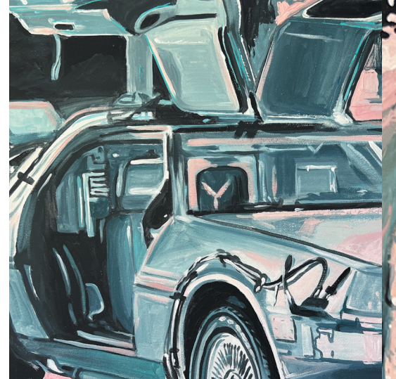
▲ Detail of the painting. The Delorean time machine with the Y-shaped flux capacitor inside.

The BTTF artwork is yet another achievement of artist Peter Engels.